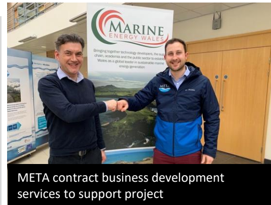
META contract business development services to support project