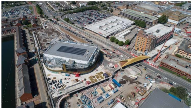
Arena – from the East

Business/operational model to be finalized